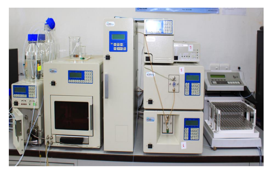
Figure 4: The main components of a modern HPLC system.