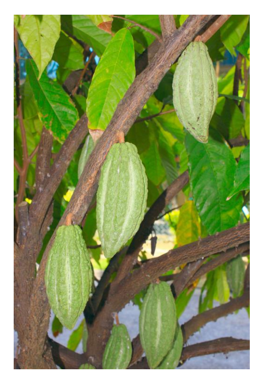
Figure 1: Cocoa ( T. cacao ) which contains high polyphenol content.

planted in Malacca in 1778 (Ruzaidi et al. 2005). Cocoa was used by ancient peoples as a medicinal plant for treating various disorders. Over 100 medicinal uses for cocoa have been documented in Europe and New Spain from the 16th to the early 20th century; it has been used to treat anaemia, mental fatigue, tuberculosis, fever, gout, kidney stones, and even poor sexual appetite (Dillinger et al. 2000). The cocoa bean contains a large number of phytochemicals, and physiologically active compounds have been reported. For example, Kim et al. (2011), reported that selected procyanidins present in cocoa inhibited tumorigenesis, tumour growth, and angiogenesis. Procyanidin-enriched cocoa seed extracts caused G2/M arrest and 70% growth inhibition in Caco-2 colon cancer cells. The consumption of cocoa or chocolate, which possesses high antioxidant activity, could be beneficial in decreasing damage caused by genotoxic and epigenetic carcinogens and inhibit the complex processes leading to cancer.