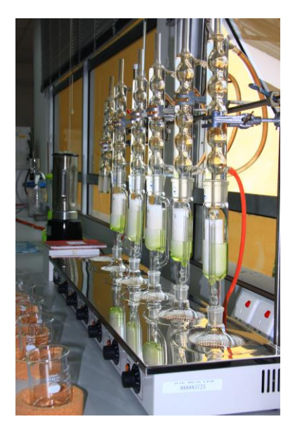
Figure 2: Soxhlet used for conventional solvent extraction which is still relevant today.

consuming procedures, and contribute to environmental preservation by reducing the use of water and solvents, fossil energy, and the generation of hazardous substances (Chemat et al. 2011). Lastly, the extraction process should provide the maximum yield of crude extract containing potential anti-cancer compounds, as well as extract of the highest quality (target compound concentrations and potential anti-cancer activities of the extracts).