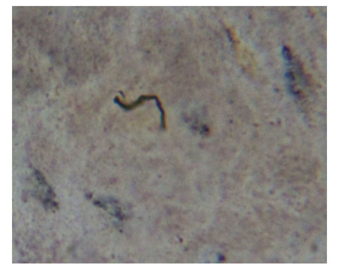
Figure 3 Spirochete detected with Dieterle silver stain in culture of skin sample from Morgellons disease patient. Notes: 1000× original magnification.