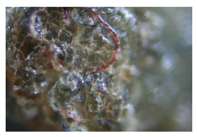
Figure 2 Multicolored fibers in Morgellons disease skin lesion. Notes: 400× original magnification.