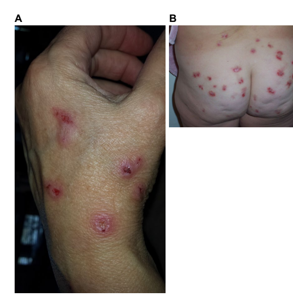
Figure I (A) Skin lesions on the hand of a Morgellons disease patient. (B) Skin lesions on the buttocks of a Morgellons disease patient.